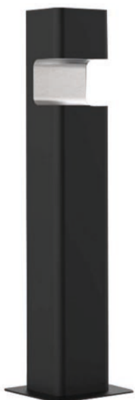
RAL 9005 BLACK

When packaging, we use reinforced cardboard boxes made of five-layer corrugated cardboard (5VVL) and repackage with a combination of fixing materials.